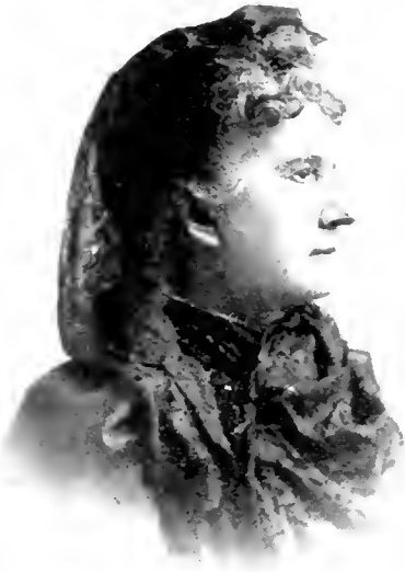
BELVA ANN LOCKWOOD.

women to the bar, she was, on 23rd September, 1873, admitted to the bar of the supreme court, the highest court in the District. She at once entered into the active practice of her profession, which she still continues after nineteen years of successful work. For about thirteen years of that time Mrs. Lockwood was in court every court-day and engaged in pleading cases in person before the court. In 1875 she applied for admission to the Court of Claims. Her admission was refused on the ground, first, that she was a woman, and, second, that she was a married woman. The contest was a bitter one, but sharp, short and decisive. In 1876 Mrs. Lockwood's admission to the bar of the United States Supreme Court was moved. That motion was also refused on the ground that there were no English precedents for the admission of women to the bar. It was in vain that she pleaded that Queens Eleanor and Elizabeth had both been Supreme Chancellors of the Realm, and